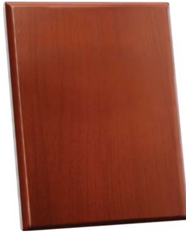
200 x 150mm rectangle