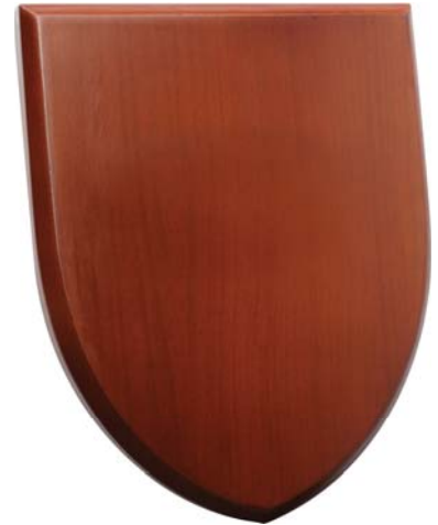
200 x 160mm shield